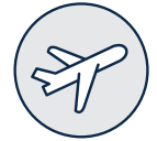
Aerospace & Auto