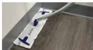
Trapezoid frame design provides easier access into corners.