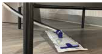
Curved pole allows for farther reach under beds, chairs and more.